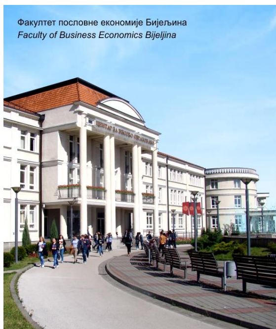
Факултет пословне економије Бијељина Faculty of Business Economics Bijeljina

Семберских ратара бб, 76300 Бијељина. Телефон: 055/415-200, Email: dekan@fpe.ues.rs.ba, Web: www.fpe.ues.rs.ba ЈИБ: 4400592530000, ПДВ: 4400592530000, Шифра дјелатности: 080302, Матични број: 01029606 Организациони код: 12510015